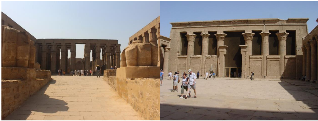
Pic2,3- Luxor temple https://en.wikipedia.org/wiki/Luxor_Temple

As the effect of winds and their direction appeared on the shape of the building plans, the wind catchers appeared to exploit the desired winds. The ancient Egyptian also took care of providing stone barriers in the cooking areas in residential buildings.